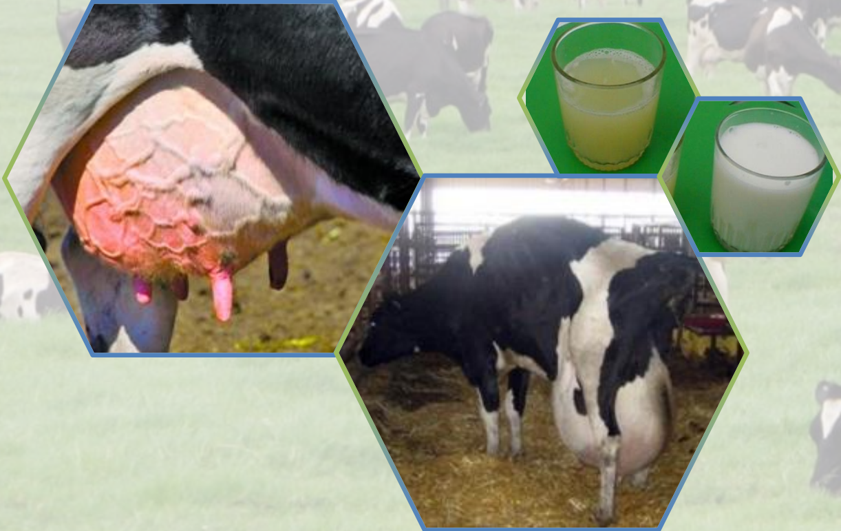
Annual per-cow losses