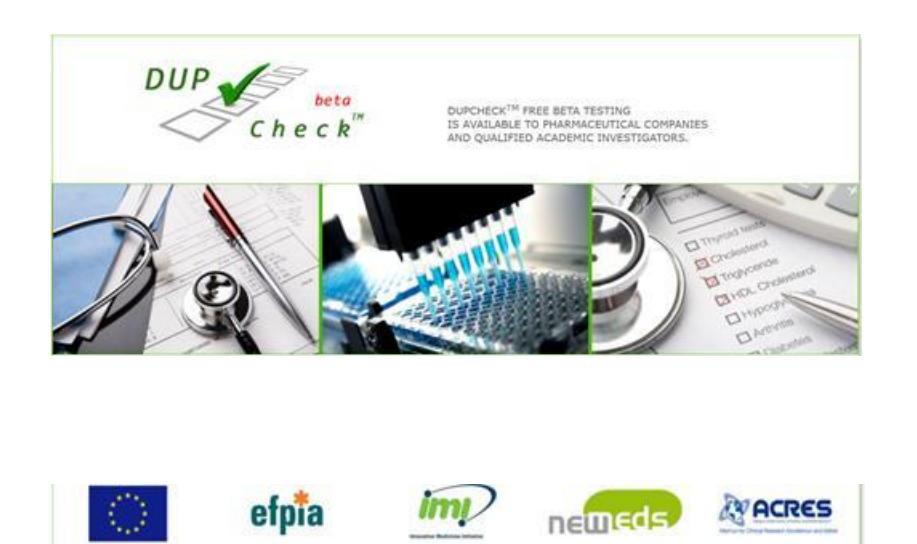
Figure 6: DUP Check web page

DupCheck is a web-based tool (https://www.dupcheck.org/) to screen for duplicate patients in clinical trials across studies, sponsors and therapeutic areas. DupCheck provides sites and sponsors with real time information on attempted duplicate enrollment at time of screening. DupCheck is now integrated with a large number of vendor eCRF and trial-management systems [see list here https://www.dupcheck.org/about.html]. DupCheck is HIPAA and European Data Protection Regulation compliant. No identifiable patient or sponsor data is transmitted, stored or shared. DupCheck was given a favourable Qualification Advice review by the European Medicines Agency and the FDA has stated that using DupCheck or equivalent strategies in trials is advisable.