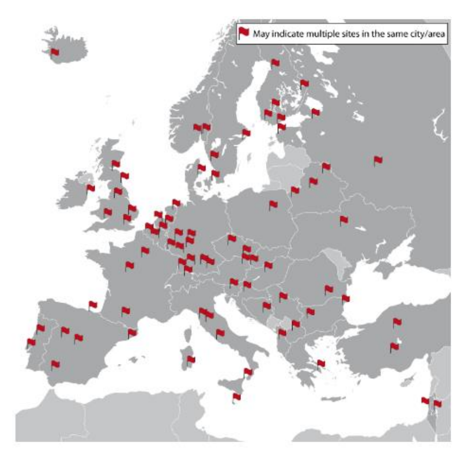
Figure 2: Clinical trial network of EU-AIMS