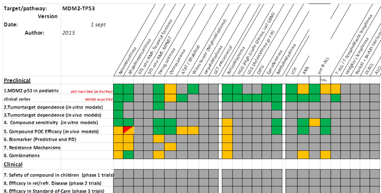
Figure 2 Systematic Literature review of target actionability; MDM2-p53 heatmap score, as an example